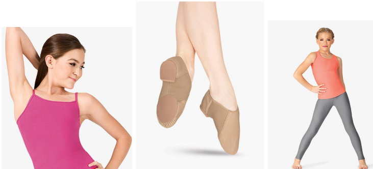
Theatricals Brand from Discount Dance

Solid Color Fitted Top (Leotard, T-shirt, Tank, Long sleeve) Solid Color Dance pants, leggings or shorts Tan Jazz Shoe for Musical Theater ----- Clean Sneakers or Jazz Shoe for Jazz Hop ----Clean Sneakers for Hip Hop